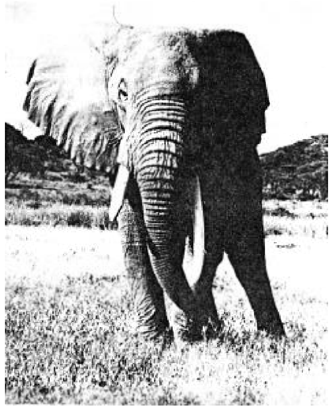
Figure 2. Amboseli bull elephant

We also noted that males with GP were not in their usual haunts, the bull areas, but were in the company of females, busily moving through the group testing each female in turn. We soon learned to be wary of any bull with GP as these males were very aggressive, not only towards other males but towards observers as well. Later in our study we found that this aggressive behaviour was due to very high counts of the male hormone, testosterone. Even-