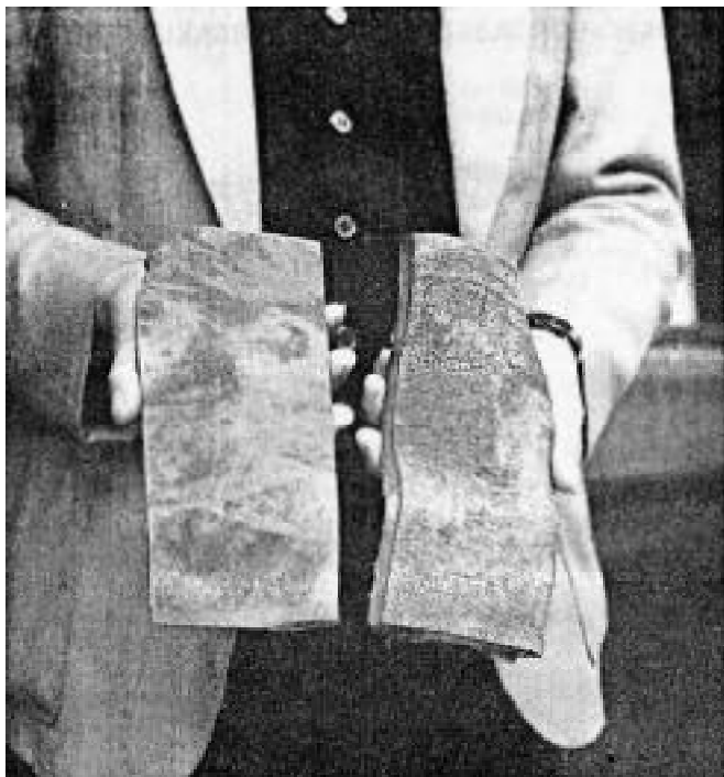
Figure 4. Rhinoceros hide, mostly from the white rhinoceros in South Africa, is used by the Chinese in Macao, I-long Kong, Singapore and Malaysia to cure skin diseases. In this photograph, a Chinese pharmacist displays on the left the underside of a dried piece of rhino hide and on the right the top side.

Today South Korea is one of the most important consumers of rhino horn. It is still legal to import the horn there if it is declared and the 42.5% tax levy is paid on it. In both Seoul and Pusan, the second largest city in the country, I found rhino horn for sale to the public. In fact, it was available in 62% of the 76 oriental medicine clinics I visited in Seoul. The official import statistics for 1981 record 142 kilos of rhino horn entering the country, but this is not the correct figure; the total annual imports were probably more than double that. Nor is the place of export given in the government's statistics correct; the vast majority of rhino horn imports — both legal and illegal — come from Hong Kong, not Indonesia.