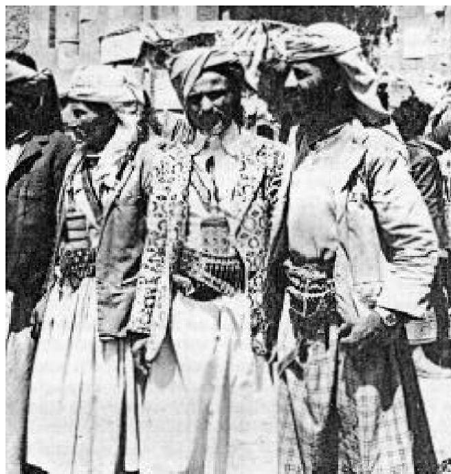
Figure 7. Most North Yemeni men wear daggers everyday, some of which have handles made of rhino horn