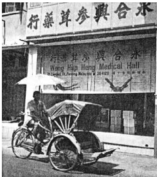
Figure 3. A typical Chinese Medical Hall in Penang, Malaysia.