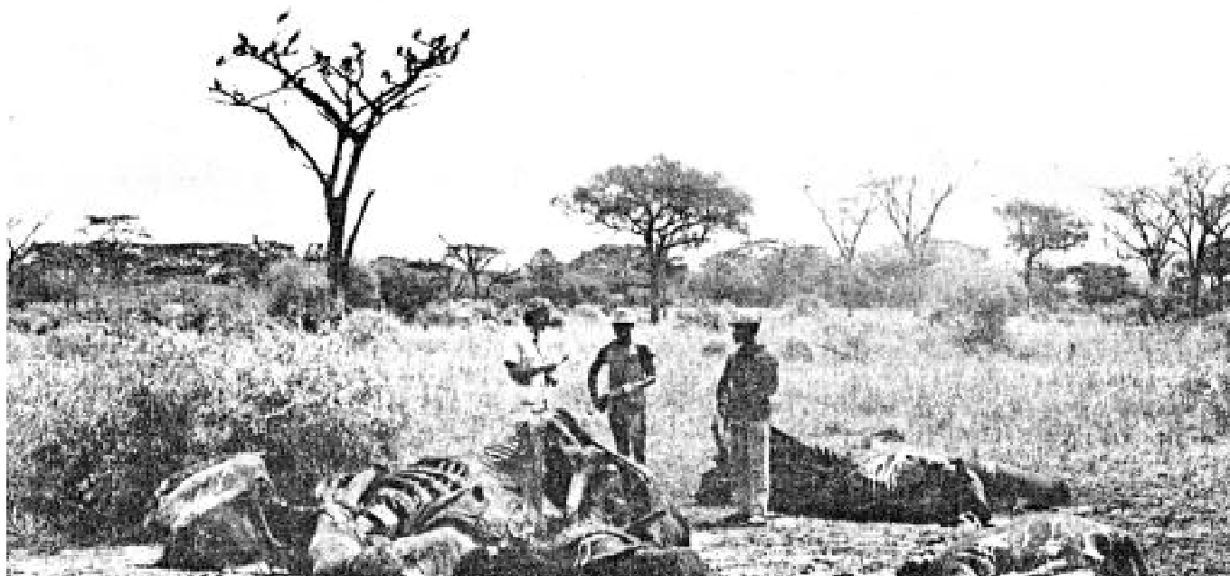
Figure 6. Poached elephants littered all three of Uganda's national parks in 1979 and 1980.

In the 1960's, three well-ordered national parks, Queen Elizabeth, Murchison, and Kidepo, existed in Uganda. They enjoyed firm political support, a sound economic basis, and an ecological problem of too many elephants. Then, in 1971, with the military coup of Idi Amin, tourism collapsed, the country's economy was wined, law and order deteriorated. High government officials and security officers sponsored elephant and rhino poaching in the national parks. By the end of the war with Tanzania in 1979, around all three parks automatic rifles had proliferated. Ex-military personnel, villagers, tribesmen, and poachers were all better armed than the rangers.